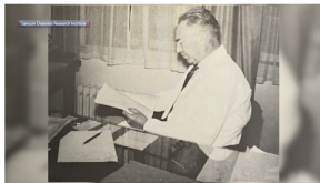
Sansum Diabetes Research Institute