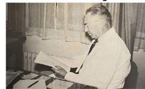
Sansum Diabetes Research Institute