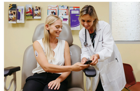
SDRI is celebrating the 100th anniversary of the first insulin injection in the United States